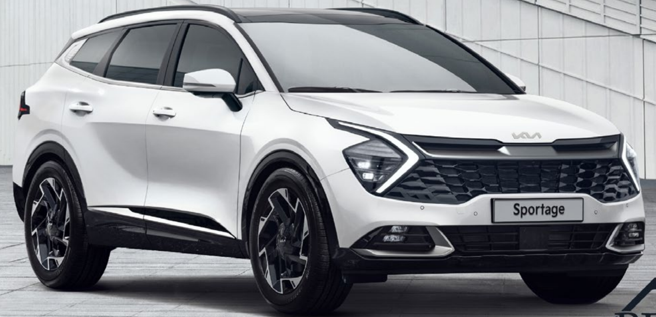
The 2022 Sportage

P&C Business Partners, thank you for always being "On top of the game" because we could not do what we do every day without you. ■